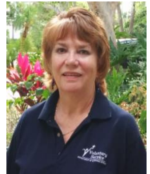
In uniform: Voluntary Services

If all of this qualifies as a "flaming liberal", I will proudly claim that label. 🍷